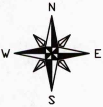
SITE PLAN SCALE: NONE